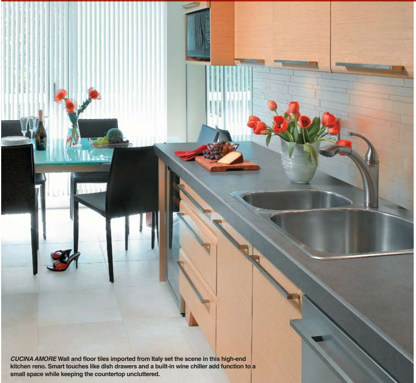
CUCINA AMORE Wall and floor tiles imported from Italy set the scene in this high-end kitchen reno. Smart touches like dish drawers and a built-in wine chiller add function to a small space while keeping the countertop uncluttered.

renovation was inspired by the high-end kitchens she has designed for clients over the years. As the interior designer and proprietor of the eponymous ceramic tile company says, "That's all I see – gourmet kitchens – and I love to cook, so I wanted one of those, too."